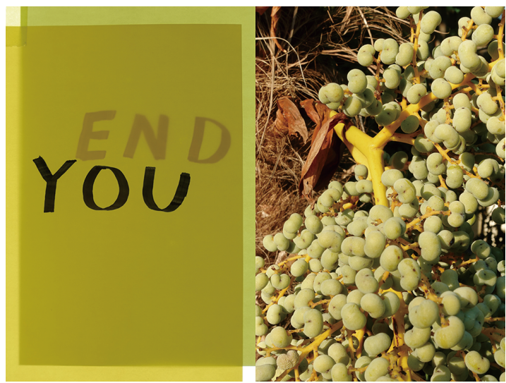
Takuma Ishikawa | Tragedy and color I | 2023 | Inkjet print | 50.8×33.8cm (set of 2, each)

This exhibition is titled "Tragedies and Colors" and deals with images using subjects from the personal living area. It consists mainly of a new series of works that connect to social narratives through the construction of their visual effects and allegories. During the exhibition, two artists who are familiar with Ishikawa's practice, Motohiro Tomii and Aya Momose, will be invited to give a talk titled "The Right of Passivity".