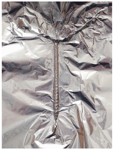
Buried things are removed outl 2022 Inkjet print I 25.4×20.3cm