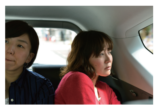
Crossing the border | 2015 | video