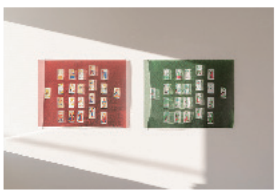
Self-portrait with Tarot Reading | 2021