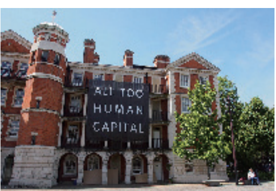
ALL TOO HUMAN CAPITAL | 2018 | Photo : Rika Nakashima