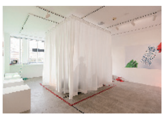
I tower over my dead body. I Installation view at Gallery TOH I 2021