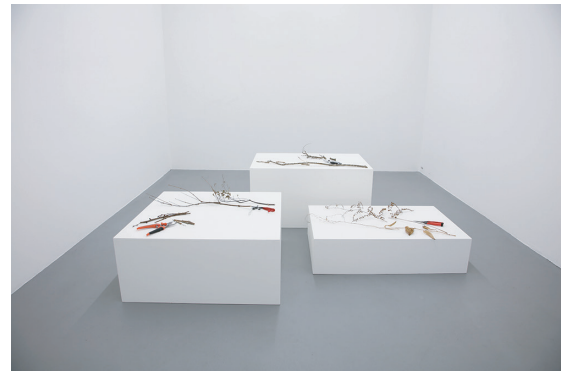
Function | 2019 | Pruning scissors, branches, weeds | Dimensions variable

The National Museum of Modern Art, Tokyo (Tokyo), The National Museum of Art, Osaka (Osaka), Museum of Contemporary Art Tokyo (Tokyo), The Museum of Modern Art, Shiga (Shiga), Kirishima Open-Air Museum (Kagoshima)