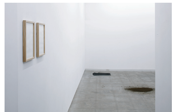
"Fact" (2017) Installation view at TALION GALLERY