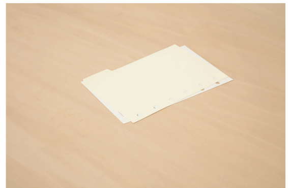
2 sheets | 2019 | Paper, glue | 8.9×12.7cm