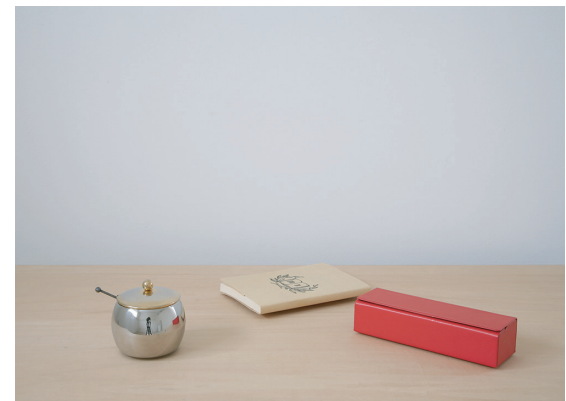
Existence | 2018 | Sugar pot, acrylic board | 7.2×8.5×7.6cm Existence | 2018 | Book, board | 2×15.2×10.7cm Existence | 2018 | Glasses case, board | 4×16×5cm