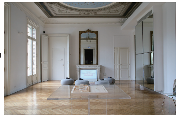
Installation view : "FUKAMI, une plongée dans l'esthétique japonaise" Hôtel Salomon de Rothschild | 2018 | Photo:Yuu Takagi