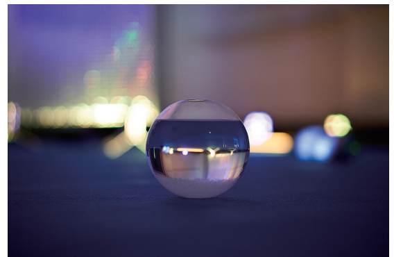
Installation view : " Climatotherapy" Somerset House | 2018