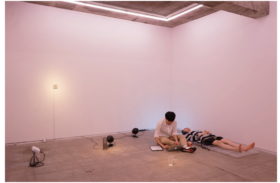
Installation view : " Immunotherapy" TALION GALLERY | 2019 | Photo : Yoshihiro Inada

2020 "Sustainable Hours - Soundtrack for installation by Nile Koetting" The Death Of Rave (UK) 2019 V.A "Being and Time" Longform Editions (AUS) 2018 "Climatotherapy" The Death Of Rave (UK) 2016 "Being and Time" duenn Label (JP)