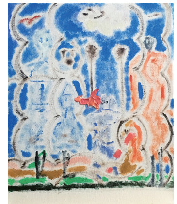
untitled | 2020 | Oil on canvas | 29.4x21cm