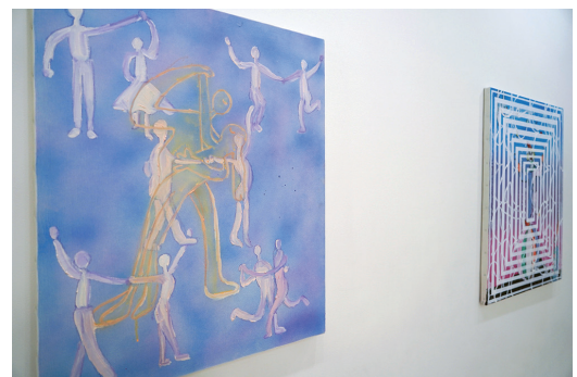
Installation view : "nursery" People | 2019 | Photo : Masahiro Otani