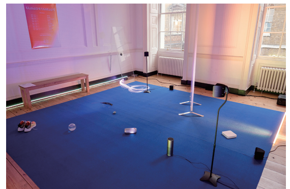
Installation view : " Climatotherapy" Somerset House | 2018 | Photo :Miles Cumpstey