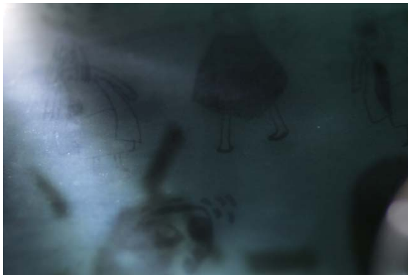
Yakushimaru Etsuko | study for ladybug | 2012

TALION GALLERY is delighted to announce the opening of Yakushimaru Etsuko’ s solo exhibition from the 1st to 29th of December, 2012