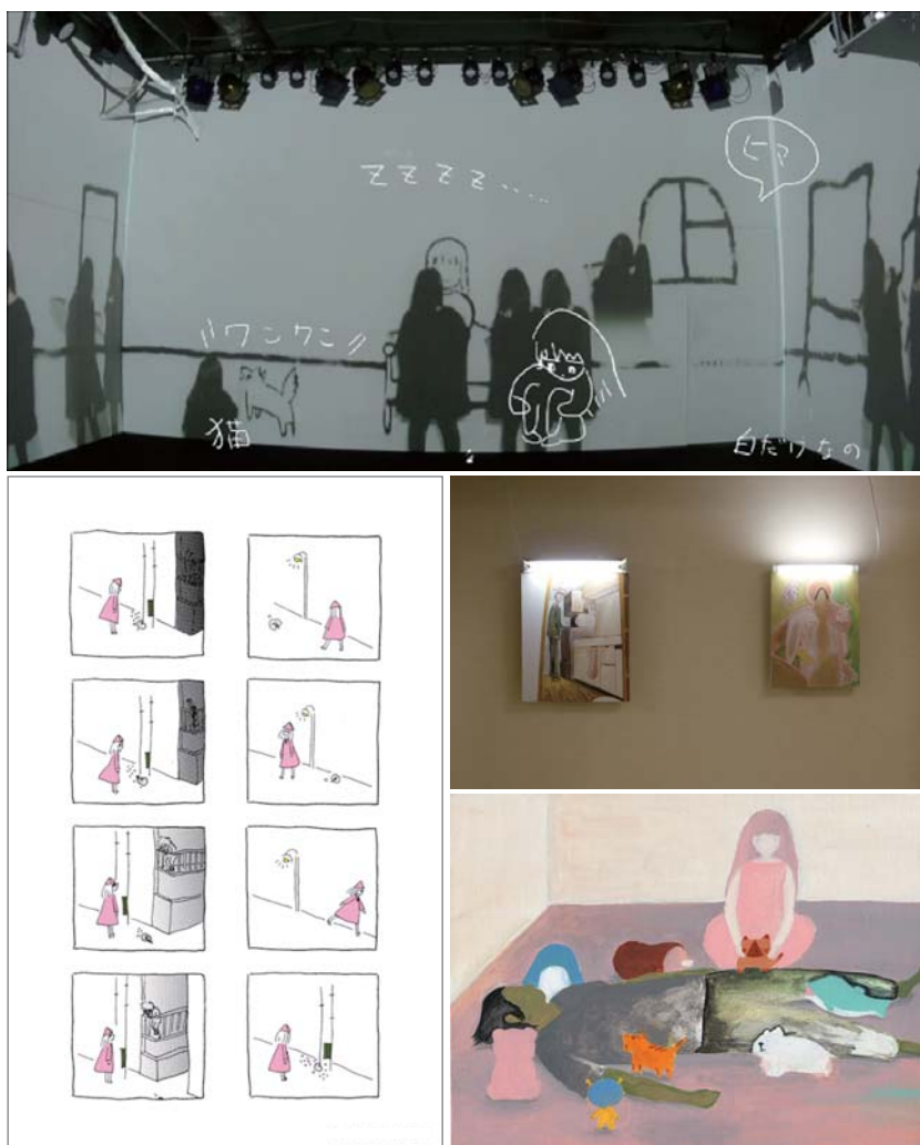
[top] Yakushiramu Etsuko | Ghost Room of "YamiYami-Lonley Planet" | 2012